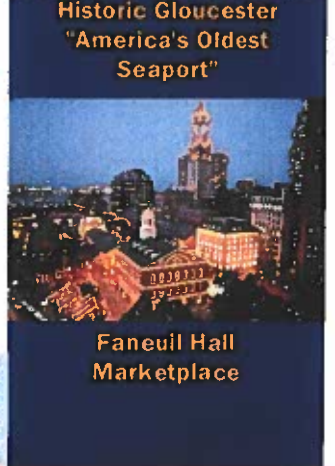
Faneuil Hall Marketplace