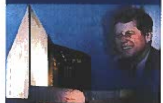
JFK Library & Museum