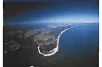
Aerial view of Amelia Island

Departure: Main Street Community Center, 1003 N. Main St, Edwardsville, IL @ 8 am