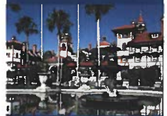
St. Augustine, our Nation's Oldest City