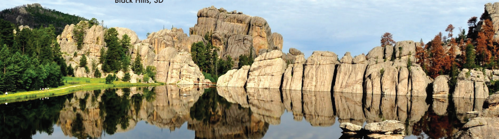
Black Hills, SD