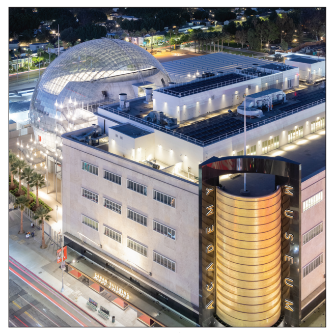
Academy Museum of Motion Pictures

With the vibrant spectacle of the Rose Parade etched in your memory, it's time to fly home. B *