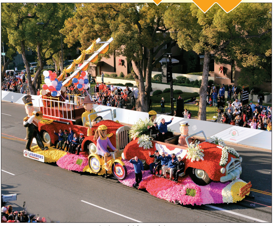
Experience the beautiful floats of the Rose Parade

New Tour Highlight: The Academy of Motion Pictures - a cultural institution dedicated to the history and art of filmmaking.